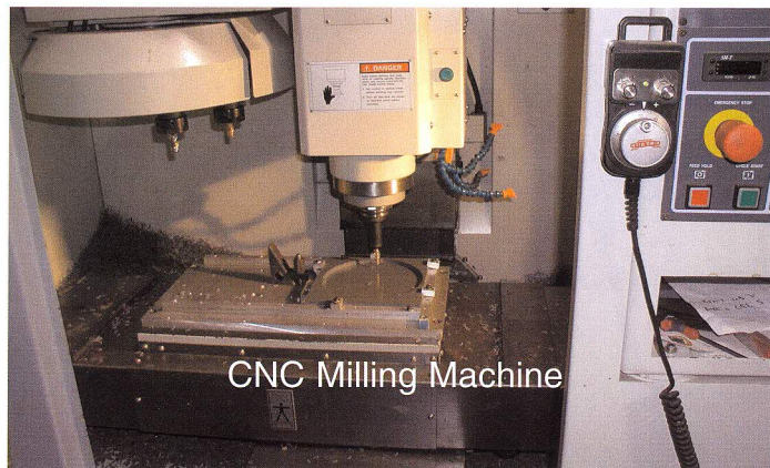
CNC Milling Machine