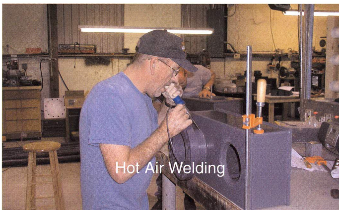
Hot Air Welding

Fluid Sealing Products, Inc. is a specialty company. Our specialty is machining and fabrication of engineering thermoplastics. We have over 20 years of experience machining and fabricating plastics. Our machines are state of the art CNC equipment and our people are highly experienced. Our welders all have a minimum of five years experience and some have as many as twenty. We have a 6000 square foot, air conditioned facility in Pasadena, Texas devoted entirely to plastics.