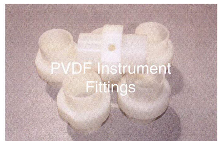
PVDF Instrument Fittings

CNC Machining of Plastic Materials Quality Specialty Fabrication Certified Plastic Welding-Hot Air and Extrusion Materials-PVC, CPVC, PVDF, Polypropylene, High Density Polyethylene, Teflon, All common plastics Prototypes or Production AutoCad Drafting Complete AQ/QC Manual