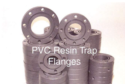
PVC Resin Trap Flanges