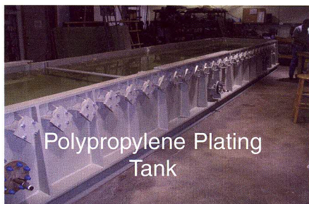
Polypropylene Plating Tank