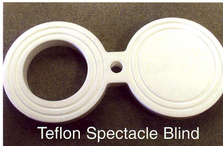
Teflon Spectacle Blind

Specialists In Machining and Fabrication of Plastics